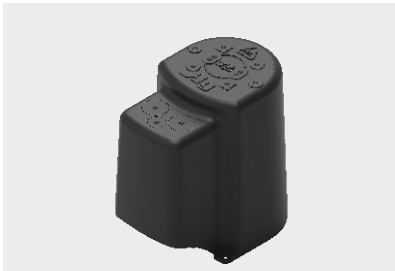
Plastic cover for DC motors Ø 114 Weight: 0,35 kg